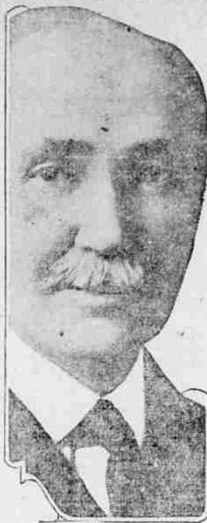
James A. Hemenway.

James A. Hemenway, former United States senator from Indiana, it is reported on good authority has been chosen to take charge of the middle west headquarters in the Republican national campaign. The post is regarded as an important one because of the fact that much of the hard fighting will be carried on in the middle west.