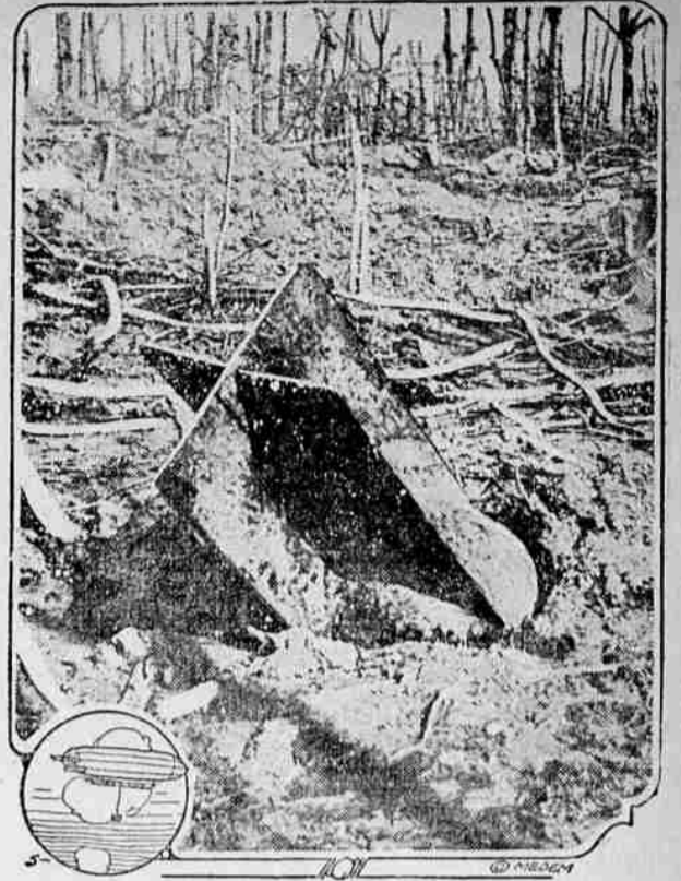
After a bombardment.

This photograph shows the type of huge, ugly torpedoes that the Zeppelins project upon the enemy in their soaring bombardment of trenches, woodlands where companies have sought hiding places and protection, and upon clumps of foliage that perchance mask enemy batteries.