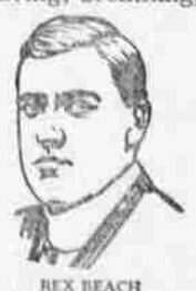
REX BEACH Famous Author, says "I have smoked Tuxedo to sub-Arctic Alaska, at Panama and everywhere—would not smoke another kind."

Among the world's great story tellers, those gifted, entertaining tellers, Rex Beach is stacking high; and I am always in my glory when I have got a new Beach story; it suits me more than pie. Red blood in all his yarns is seething; his characters are living, breathing, not dummies made of wood; strong men admire his kind of writing, of heroism, peril, fighting—it's always to the good. And Rex, when he is busy working, his trusty old typewriter jerking, until it busts a spoke, to have his inspiration quickened keeps all the air around him thickened with rich Tuxedo smoke. Say, have you noticed, gentle readers, how many famous men and leaders explain Tuxedo's worth? As man's great solace they expound it, and that's because they all have found it the best there is on earth.