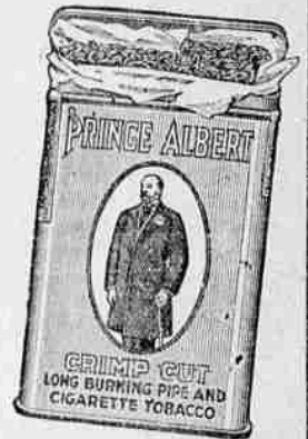
On the reverse side of this tin you will read: "Process Patented July 30th, 1907," which has made three men smoke pipes where one smoked before!

R. J. REYNOLDS TOBACCO CO., Winston-Salem, N. C.