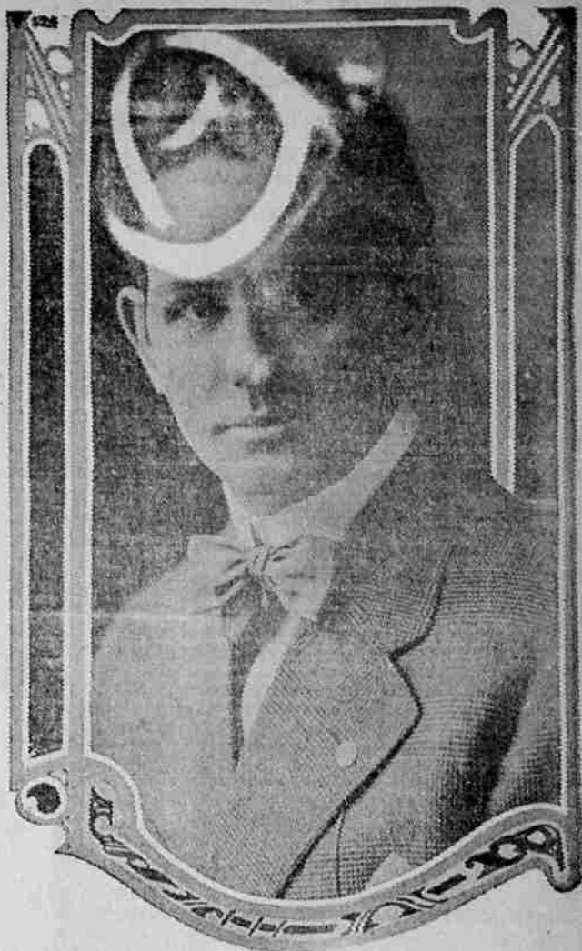
DONALD BRIAN, FAMOUS PLAY PARAMOUNT STAR.