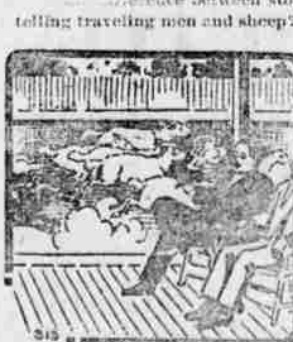
telling traveling men and sheep?

EUROPEAN PLAN 116 Rooms, 44 with Private Bath Rates $1.00 per day up. W. J. WEAVER, Prop.