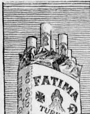
A Sensible Cigarette