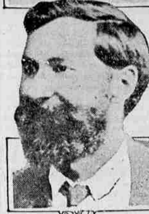
Mr. and Mrs. F. Sheehy Skeffington.

F. Sheehy Skeffington, until recently a resident of Long Island City, N. Y., was shot and killed as a participant in the Irish rebellion. According to Mrs. Skeffington, her husband was taken prisoner when at the risk of his own life he went to the rescue of a wounded officer outside of Dublin castle. She says he was arrested and executed without a real trial.