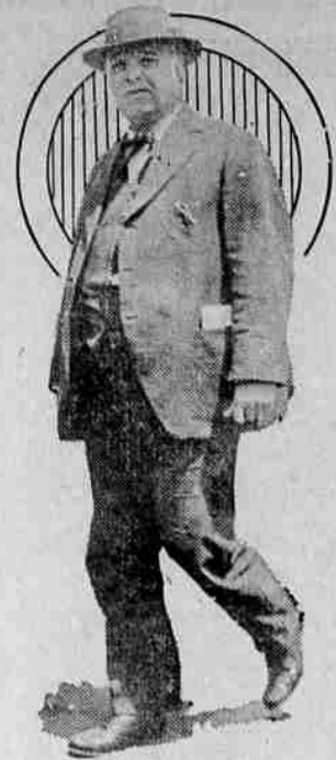
Simeon D. Fess.

Representative Simeon D. Fess, of Ohio, will handle the publicity end of the Republican congressional campaign committee's work this year.