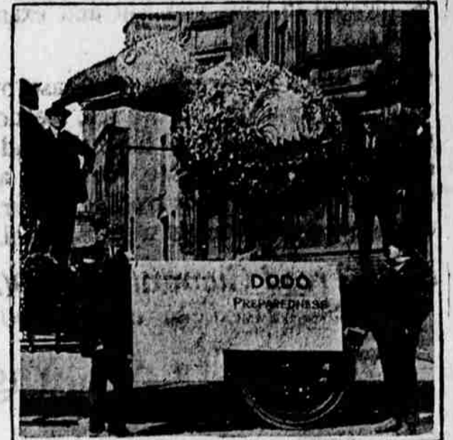
Exhibiting the dodo in Chicago streets.

Some weeks ago the advocates of unpreparedness exhibited in the leading cities of the country a restored dinosaur, with a legend that this extinct animal was all armor plate and had no brains. Not to be outdone, Chicago advocates of preparedness restored the dodo, also extinct, and exhibited him in the streets.