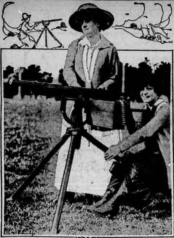
Maryland women taking lessons on machine gun at Winthrop, Md.