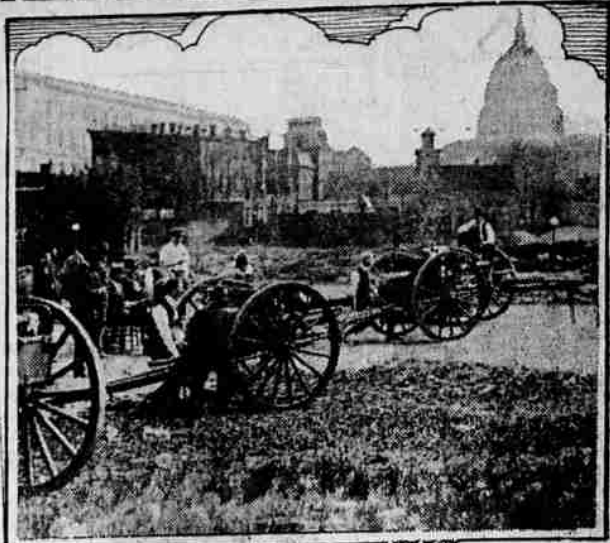
National guardsmen in Washington; capitol dome in distance.

Since the recent trouble in Mexico began it has been the ambition of every national guardsman around Washington to qualify as a first-class gunner. For the convenience of visiting guardsmen, and for others who have to utilize odd moments snatched from their work, army officers have set up field pieces on the capitol grounds. Here contestants go through all the motions of loading, aiming and firing under the spur of stop-watches and expert supervision.