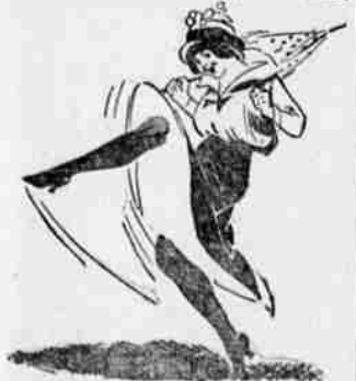
"Whee! I Don't Care! I Got Rid of My Corns With Gets-It!"

Isn't it wonderful what a difference just a little "Gets-It" makes—on corns and calluses? It's always right somewhere in the world, with many