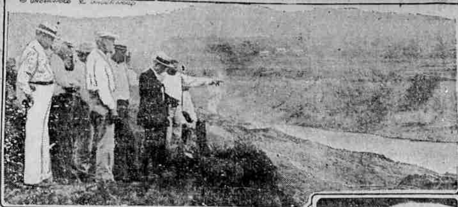
COL. COETHALS and U.S. ENGINEERS INSPECTING CANAL

The United States army at Panama has shown the way for the sanitary conquest of the tropics and the unlocking of tremendous stores of natural riches, according to Surgeon General William C. Gorgas. The remaining problem for the utilization of this wealth, he says, has to do with its fair distribution after it has been produced. "We have successfully combated every tropical disease," he says, "and have shown that the man from the temperate zone can live and work near the equator with a fair degree of comfort and entire safety, if he follows reasonable precautions. "Our success is certain to turn attention to the tremendous agricultural possibilities of certain regions that have heretofore had scanty development, owing to the white man's fear of climatic diseases. Two tropical valleys, those of the Amazon and the Congo, are capable of producing