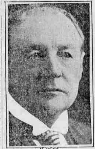
Senator Francis G. Newlands.

Senator Francis G. Newlands of Nevada has introduced a resolution in the upper house calling upon the warring rations of Europe to make pence. The resolution suggests that conditions in Europe shall remain exactly as they were before the war, that no boundary shall be changed and no indemnities paid.