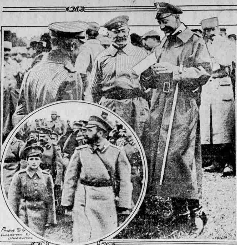
The German crown prince was caught with a smile on his face (upper photo) just as he was reading a message from the Verdun front telling of new gains for the Germans. French officers captured at Verdun are shown in the background. The lower photo, taken near the Russian front, shows the czar and his son, the crown prince, reviewing a regiment of Cossacks.

After a short preliminary examination, Justice of the Peace I. B. Riddle placed Watters under $500 bonds to appear before the grand jury. Being unable to furnish the bonds he was confined in the county jail.