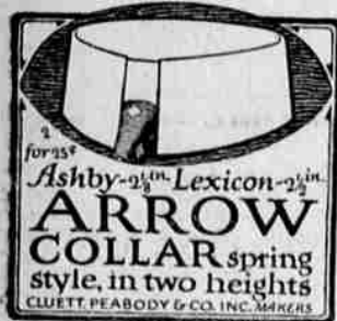
Ashby's Lexicon ARROW COLLAR Spring style, in two heights. CLETT, PEABODY & CO. INC. MAKERS

All the latest stunning creations of the modiste's art are worn by Helen Ware, who stars in the new