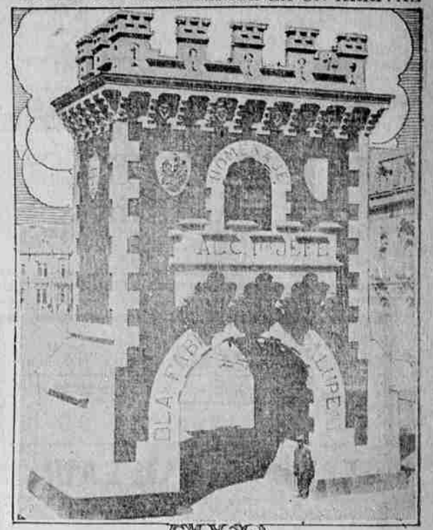
Triumphal arch in front of War College, Mexico City.

This triumphal arch was recently erected in front of the War College on the principal plaza in Mexico City, in honor of the anticipated visit of General Carranza. The inscription on the balustrade reads: "Homage to the First Chief."