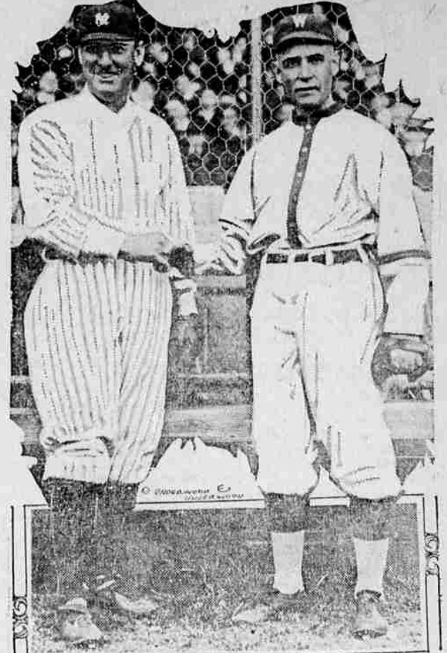
Managers Donovan and Griffith at opening game. Just to prove to the spectators at the opening game between the Yankees and the Washingtons that their rivalry was of the most friendly sort, Managers Bill Donovan and Clarke Griffith shook hands.