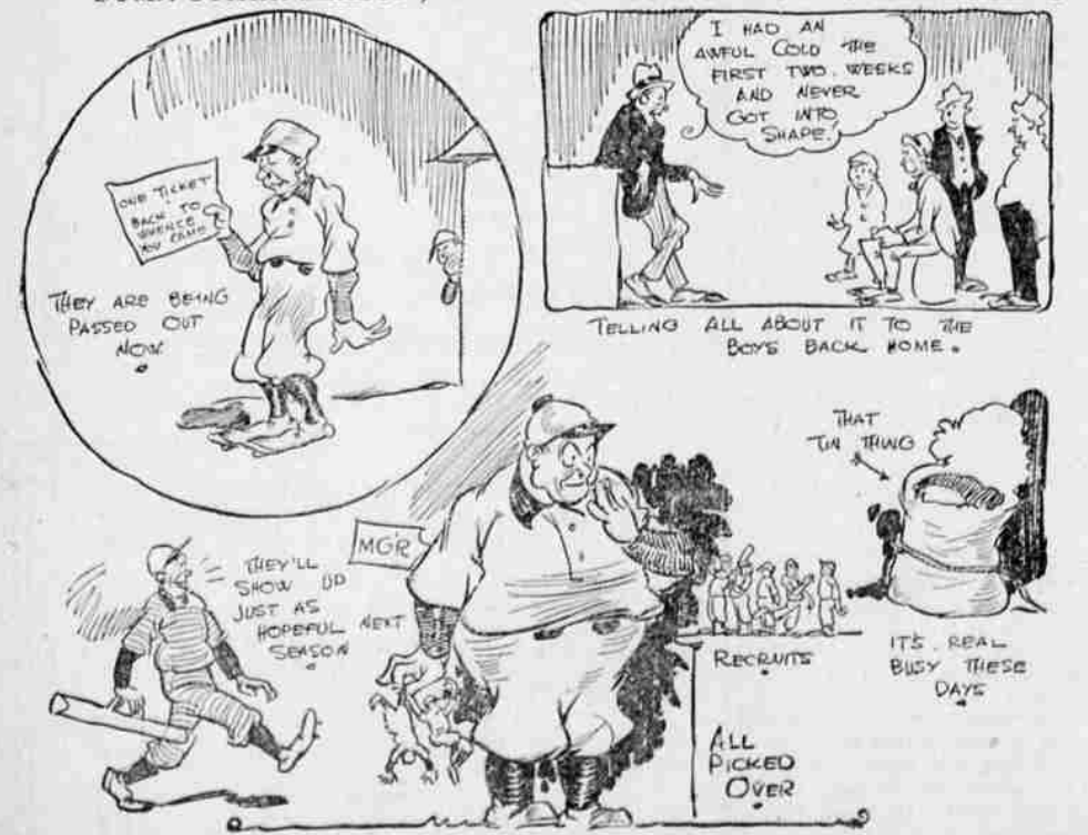
This is the season when the hopefuls of the early training days return to whence they came with an aching back. The manager has had a chance to pick them over and in baseball as elsewhere many are called but few are chosen.