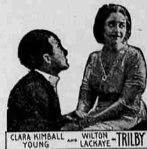
CLARA KIMBALL YOUNG and WILTON LACKAYE - "TRIBLY"

"Tribby," perhaps the most popular book and play ever presented internationally, comes to the Majestic theatre on Friday, April 14, as dramatized by the Equitable Motion Pictures Corporation, with the queenly screen artiste, Clara Kimball Young, and Wilton Lackaye, who originated the role of "Sven-