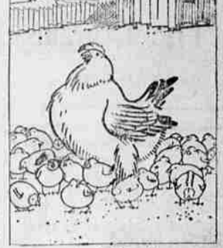
"Cluck, cluck, cluck." (If you have guessed that Mrs. Hen was vain, you have guessed about right!)

Now all the little chicks didn't understand one thing about gardens, or around the house, or yards, or digging for worms, or—