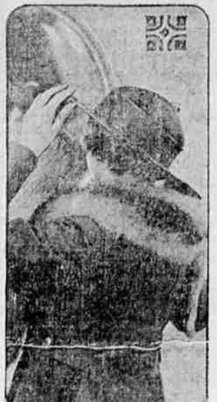
Half the beauty of your spring hat is the way you pose it—tilt it a trifle to the side

Will you please tell me if one can get the brassieres for the reduction of the