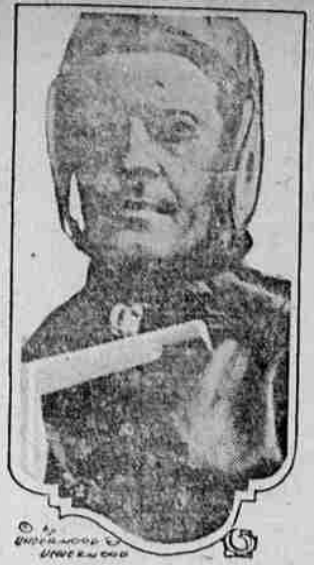
Captain Benjamin D. Foulois.

Captain Benjamin D. Foulois will command the air scouts that will accompany the American troops into Mexico to capture Villa. Eight aeroplanes will go with the first force of troops and will be followed with a reserve force that is being formed now.