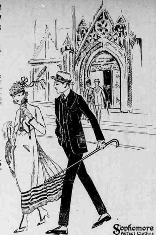
Sophomore Perfect Clothes