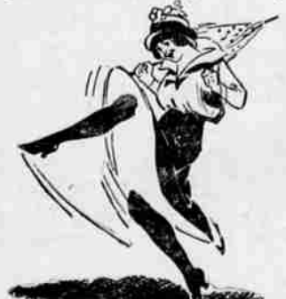
"Wheel! I Don't Care! I Got Rid of My Corns With 'Gets-It!'"

Isn't it wonderful what a difference just a little "Gets-It" makes—on corns and calluses? It's always right somewhere in the world, with many