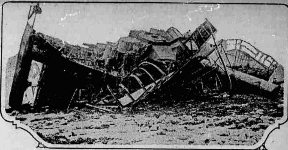
The ruins of the S. S. Scotia, beached at Sully, England.

The fame of the Scotia, which burned in Bristol Channel this month and was beached at Sully, lay in the fact that she carried the Scottish national antarctic expedition to the South Polar regions under the command of Dr. William S. Bruce, where she carried out some valuable work in co-operation with the English expedition under Captain Scott, and German and Swedish expeditions. Following the ill-fated voyage of the Titanic, the Scotia was used to carry out ice observations, meteorology and oceanography in the North Atlantic ocean.