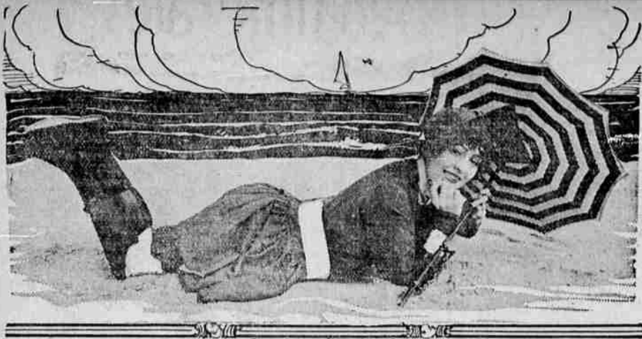
Mrs. Sidney A. Williams and her new sun bathing costume, at Palm Beach, Florida.

This novel creation, seen at the famous Florida winter resort, is of yellow silk crepe. The sleeves are extremely long, covering the wrists. The skirt is very short, seven or eight inches above the knees. The collar is rather high. Belt, cuffs and collar are of white linen, as are the French knee caps. The four-cornered hat is of yellow silk to match. The trim of the hat is of navy blue. The parasol is a Japanese model with black and white stripes and a touch of green. No more striking costume for sun bathing can be imagined.