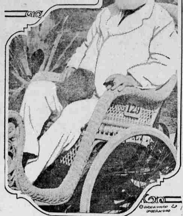
Alexander Graham Bell at Palm Beach, Florida.

Alexander Graham Bell, inventor of the telephone, is one of many notables who are spending the mid-winter months beneath the balmy skies of Palm Beach, Florida. Dr. Bell was born in Edinburgh, Scotland, in 1847. In 1871 he went to Boston, and five years later he invented the telephone and secured a patent for it. Today there are nearly 15,000,000 telephones in use throughout the world.