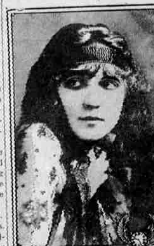
LOUISE GLAU in "THE FORBIDDEN ADVENTURE" FIVE-ACT MUTUAL MASTERPIECE