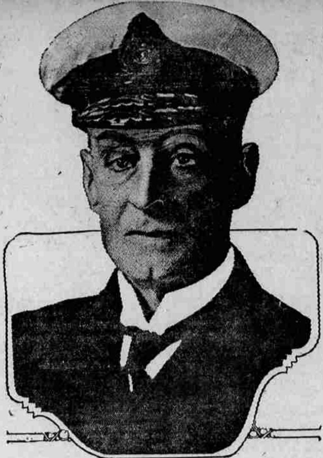
Admiral Sir Henry B. Jackson.

Admiral Sir Henry B. Jackson, who has become first sea lord of the British admiralty in succession to Lord Fisher, has not only served on numerous technical committees in connection with the equipment and design of warships, but was the first in England to put Hertzian waves to practical use for wireless telegraphy; and he has done very much toward introducing "wireless," perfecting it, and organizing it in the British navy. He is also an expert in torpedoes and the submarine.