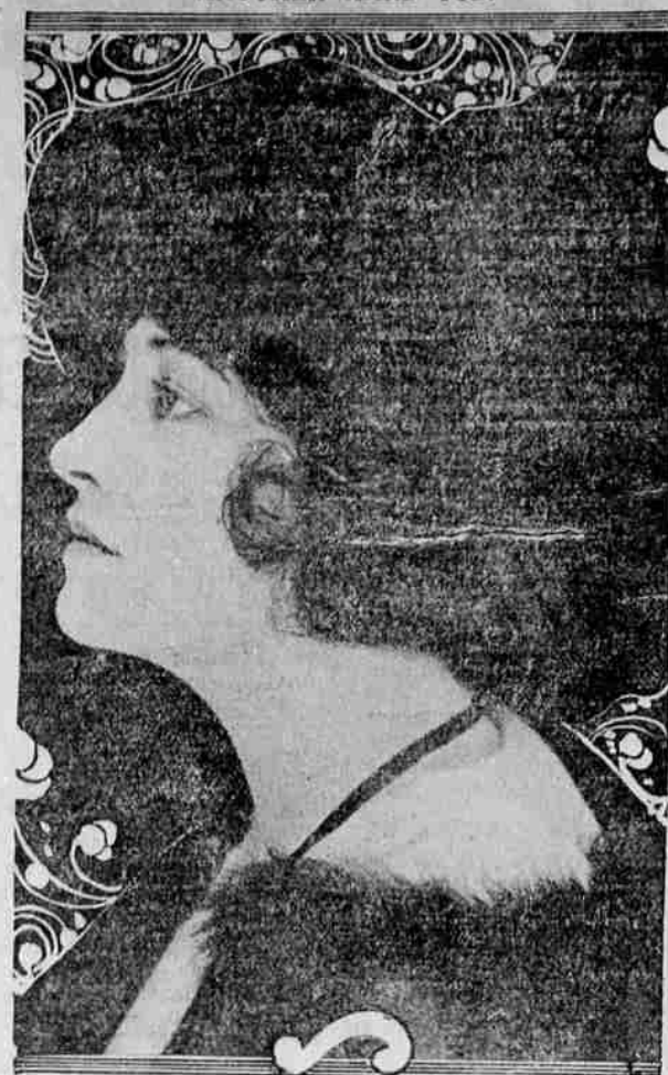
PAULINE FREDERICK IS SOMETIMES CALLED THE LOVELIEST ACTRESS ON THE AMERICAN STAGE—AND SHE IS SOMETIMES CALLED THE BUSIEST ACTRESS. SHE HAS APPEARED IN THREE IMPORTANT PRODUCTIONS THIS SEASON AND NOW SHE'S ARRANGING FOR A SUMMER ENGAGEMENT.