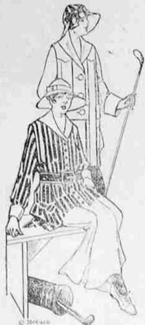
The Belted Norfolk