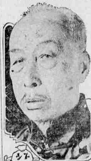
Chang Chen Hsun.

"For Japan to take advantage of the present crisis in Europe as an opportunity for the enslavement of China in the moment of her weakness has not been an honest or an admirable course in any way," says Chang Chen Hsun, the richest man in China, who is now touring the United States. "No nation ever did a more terrible thing."