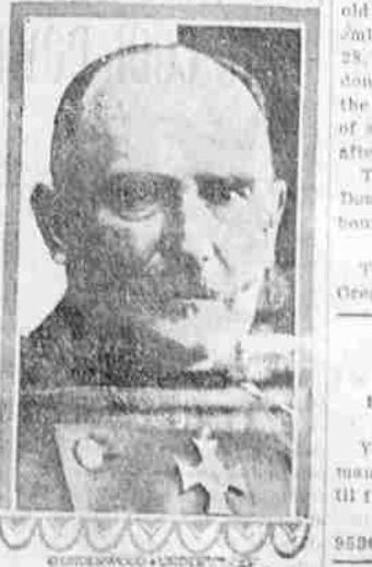
GEN. VON BESELER, COMMANDER OF ANTWERP AND KNOWN AS THE "BATTERING RAM" IS THE MAN SEEN BY THE KAISER TO TAKE THE RUSSIAN PORT, RIGA, ON THE BALTIC.