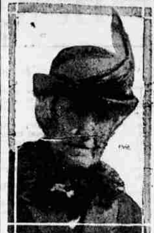
MRS. E. H. HARRIMAN WIFE OF THE LATE E. H. HARRIMAN, RAILROAD MAGNATE, WHO OWNS MOST OF THE $1,000,000,000 WHICH IS IN THE HANDS OF THE WEALTHY WOMEN OF THE UNITED STATES.