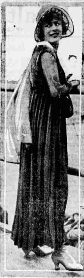
ANITA STEWART, THE YOUTHFUL MOVIE STAR KNOWN AS "THE GODDESS," WHO WAS SNAPPED WHILE WATCHING THE MOVIE CARNIVAL AT BRIGHTON BEACH, NEW YORK.

The unobtrusive companion that keeps the picture story of your vacation is the kodak. We have them in all sizes and prices, also Eastman Photo supplies. The Roseburg Book Store. dsw-810-tf