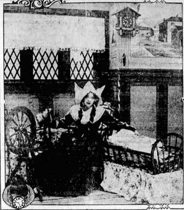
SCENE FROM "RUMPELSTILTSKIN" FIVE-PART MUTUAL MASTERPIECE PRODUCED BY NEW YORK MOTION PICTURE CORPORATION The Wonder Picture at the Palace Theatre for Tonight Only.