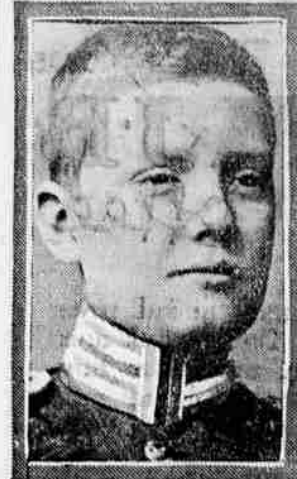
CROWN PRINCE GEORGE OF SAXONY WHO WILL RULE POLAND SHOULD KAISER WILLIAM DECLARE A NEW KINGDOM OF POLAND