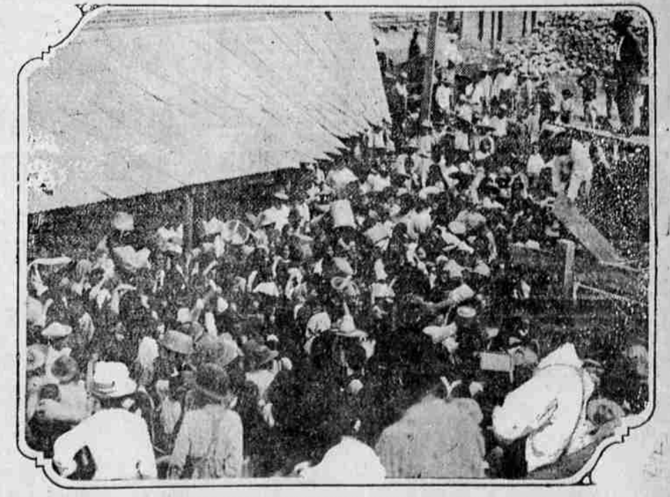
Mexicans in line to receive free corn at distributing point in Tampico.

The accompanying photograph recently received from Tampico by the American Red Cross shows the starving people of Mexico striving to reach the point where free corn is being distributed, and indicates the unhappy condition of the noncombatants in the revolution ridden republic to the south. These people have been facing starvation for months and now have reached the acute stage where only food supplies from the United States or some other outside agency can save them from death.