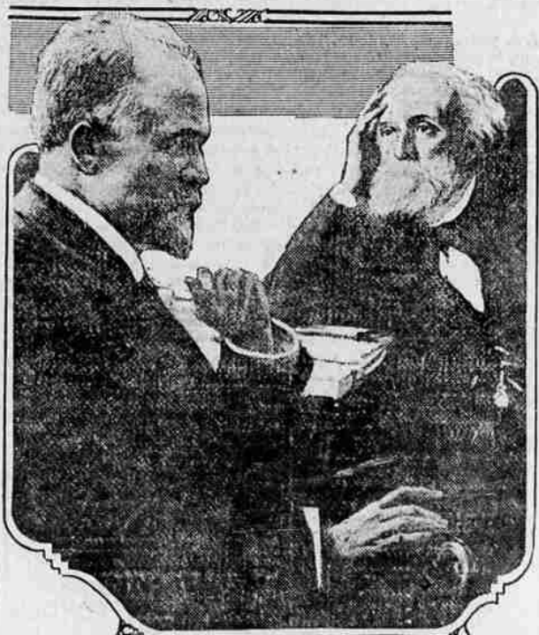
President Poincare (left) and Alexandre Ribot in conference.

Since the beginning of the present war, Alexandre Ribot, French minister of finance, has borne upon his shoulders the burden of responsibility of furnishing all the money and, above all, the supplies needed for the operations on land and sea for the defense of France. He is a financier of wonderful skill and resource, and is regarded as one of the greatest expert authorities on matters pertaining to finance.