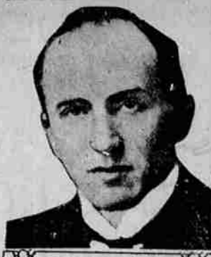
Sir John A. Simon, secretary of state for home affairs.