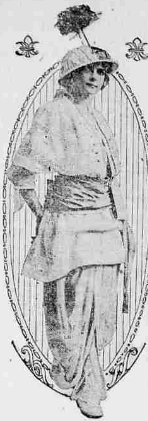
CRAPE AFTERNOON GOWN.

They Are Fashionable For Spring Costumes.