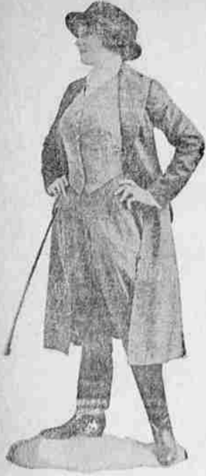
IT'S SMART FOR COUNTRY WEAR.

What the Debutante Will Wear This Spring.