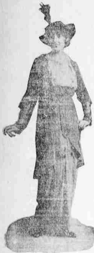
IN DRESS OF WINE SHADE.

French serge in one of the beautiful new wine tones called dregs of wine, unbordered with gold and silver