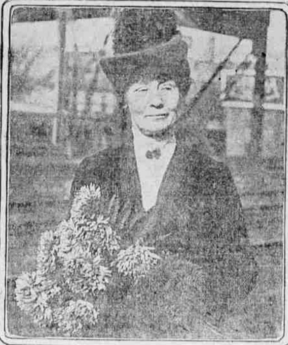
This photograph shows Mrs. Edeline Pankhurst upon her arrival in Chicago. She is wearing a long coat with which she was presented by the committee which met her at the station. As she emerged from the station she was greeted by the cheers of the throngs of women who had gathered to see her.

When interviewed Mrs. Pankhurst said: "We will have suffrage in England as soon as we can get rid of the present government. That will not be very long."