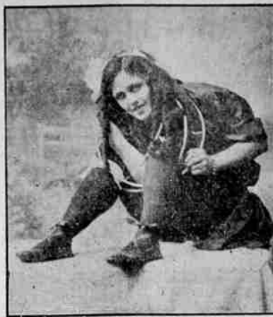
Quick Change Artist at The Antlers Theatre Wednesday and Thursday.