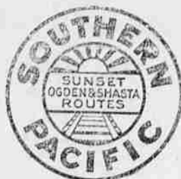
"The Exposition Line 1915"

Following the extreme Western and Southern rim of the United States. The Sunset Route insures low altitudes, mild, delightful climate and picturesque scenery, rich with color and historic interest.