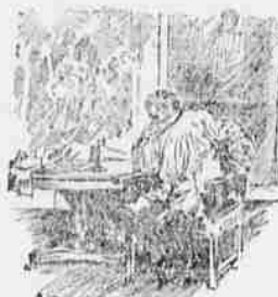
"What he had said he say he up the wire via bug?"