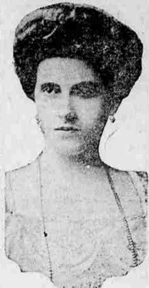
PRINCESS ALICE OF GREECE.

Women of the Balkan Countries Now at War.