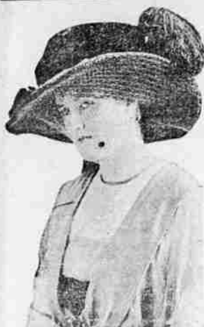
WHITE VEIL WITH BLACK SPOT.

The latest whim of Mme. la Mode is the white veil with a black beauty spot which comes wherever the ordinary beauty spot of court plaster would be chic, becoming or daring.