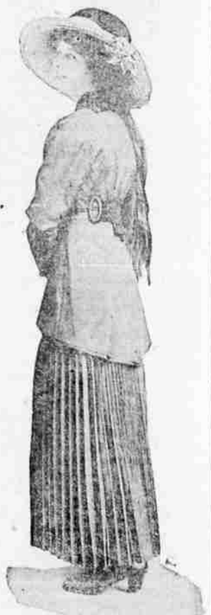
GIRLISH SUIT WITH CUTAWAY COAT.

The cutaway coat is really not a style suitable for the very young girl, but the natty little costume pictured is an exception to this sartorial rule. English worsted in brown and green mixture is the fabric used, and the