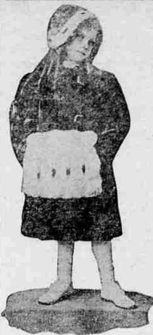
OF MOLESKIN AND ERMINE.

Simplicity, Yet Richness, In This Fur Coat.