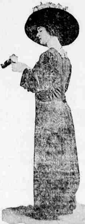
MODEL OF BROWN BROADCLOTH

A Delightfully Chic Suit. matter what the current style. ertain Parisian dressmaker manage to introduce into it her favorite pointed motif. The suit illustrated for fall wear is made of brown broadcloth, and