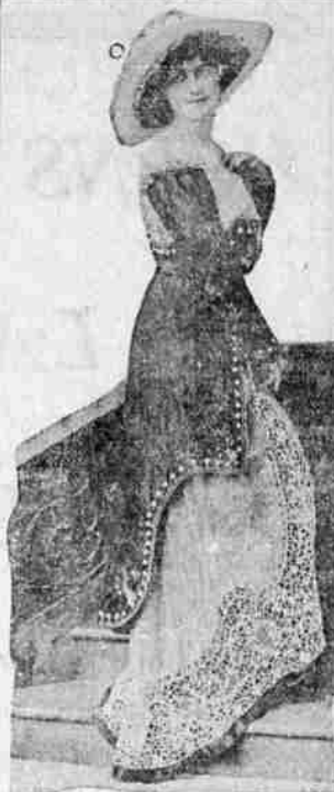
LINGERIE PROCK WITH SILK COAT.

The lingerie frocks of high degree have adorable little taffeta coats, which make them very dressy for afternoon occasions.