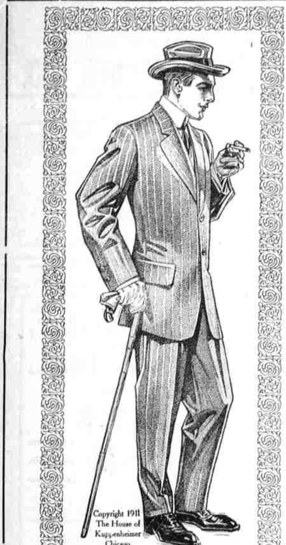
Copyright 1911 The House of Kuppenheimer Chicago