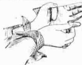
SIMMONS GLOVES RIGHT WAY TO PUT ON KID GLOVES

When you want the best, ask us for SIMMONS KID GLOVES