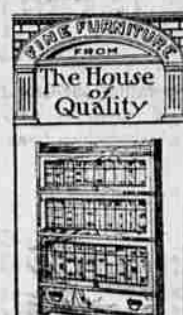
Globe Wernicke "Elastic" Book Cases.

You are always welcome at this store. Children given same courtesy and attention as grown folks. We will not be undersold if we know it. Full value for your $