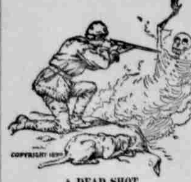
A DEAD SHOT

Right at the seat of difficulty, is accomplished by the sure and steady aim of Dr. Sage's Catarrh Remedy. Don't fool around with a pop-gun, nor a "Flint-lock," when this reliable "Winchester" is within reach!